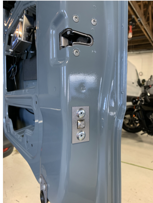
Front Cab Door "passenger-side" Housing Location