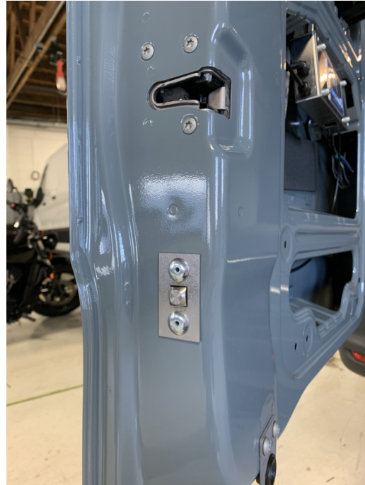
Front Cab Door "driver-side" Housing Location