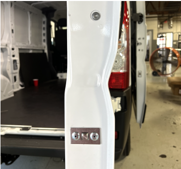
Rear Swing Door "passenger-side" Housing Location