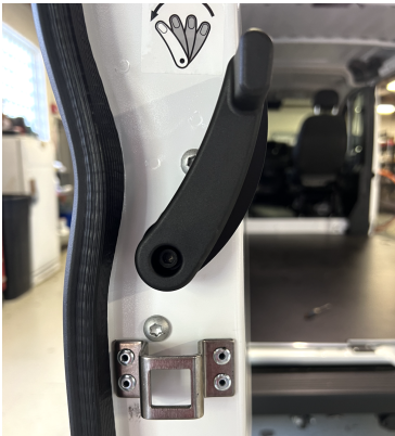
Rear Swing Door "driver-side" Raised Strike Bracket Location