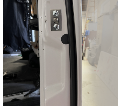
Rear Swing Door "passenger-side" Housing Location