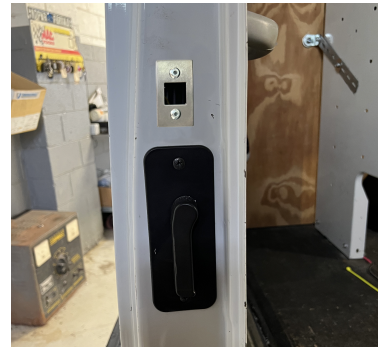
Rear Swing Door "driver-side" Strike Plate Location