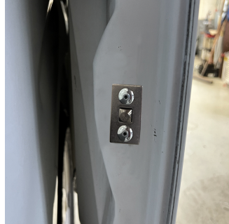
Side Sliding Door "passenger-side" Housing Location