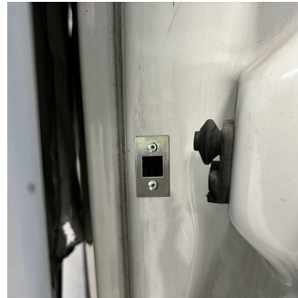
Side Sliding Door "passenger-side" C-Pillar Strike Plate Bracket Location

The templates are provided as a guide to help with the installation process. Once the template is printed, measure the 2-inch ruler on the printed page to ensure it is in the correct proportion. The templates were created based on late-model vans and may not fit your vehicle. We encourage you to review the provided photos of your specific van on our website. Be sure to measure twice and drill once, but only after checking that there are no obstructions behind the drilling location. Thunderbolt Locks, Inc. takes no responsibility for drilling holes in the wrong locations or for unforeseen damage. Only use the templates if you understand and are in agreement.