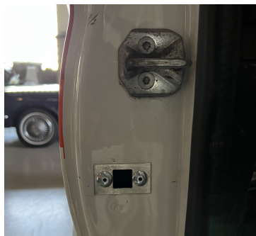
Side Swing Door "passenger-side" Strike Plate Location

The templates are provided as a guide to help with the installation process. Once the template is printed, measure the 2-inch ruler on the printed page to ensure it is in the correct proportion. The templates were created based on late-model vans and may not fit your vehicle. We encourage you to review the provided photos of your specific van on our website. Be sure to measure twice and drill once, but only after checking that there are no obstructions behind the drilling location. Thunderbolt Locks, Inc. takes no responsibility for drilling holes in the wrong locations or for unforeseen damage. Only use the templates if you understand and are in agreement.