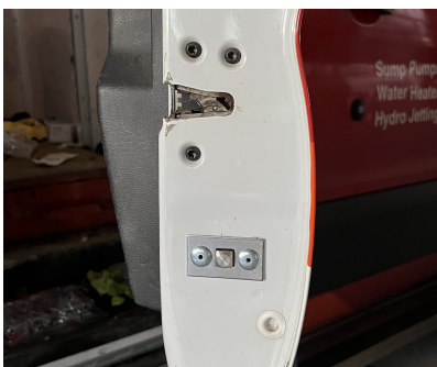
Side Swing Door "passenger-side" Housing Location