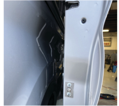
Side Sliding Door "passenger-side" Housing Location