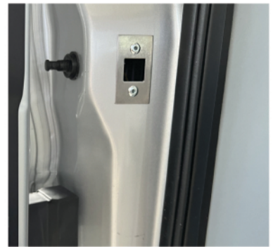
Side Sliding Door "C Pillar" Strike Plate Location