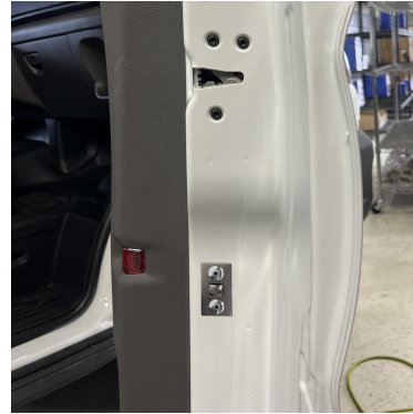
Front Cab Door "passenger-side" Housing Location