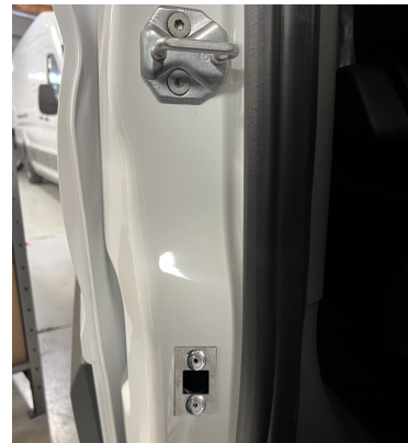
Front Cab Door "passenger-side" Strike Plate Location B-Pillar

Align this edge of the template with the edge of the door.