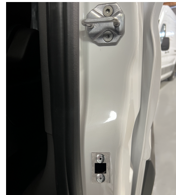
Front Cab Door "driver-side" Strike Plate Location B-Pillar