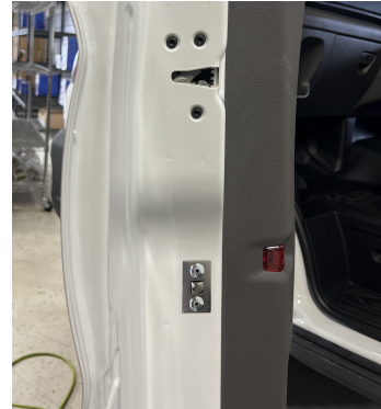
Front Cab Door "driver-side" Housing Location