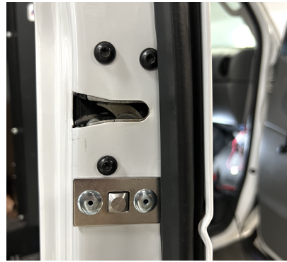
Side Swing Door "passenger-side right" Housing Location