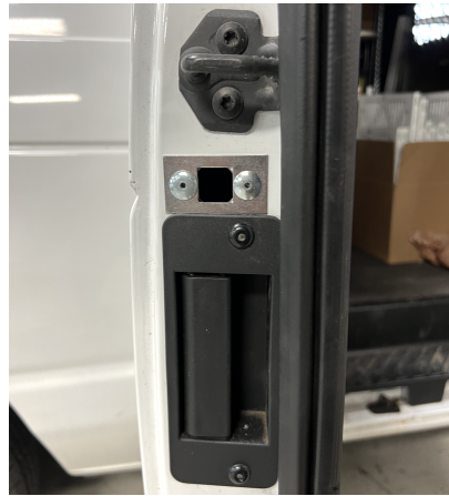
Side Swing Door "passenger-side left" Strike Plate Bracket Location