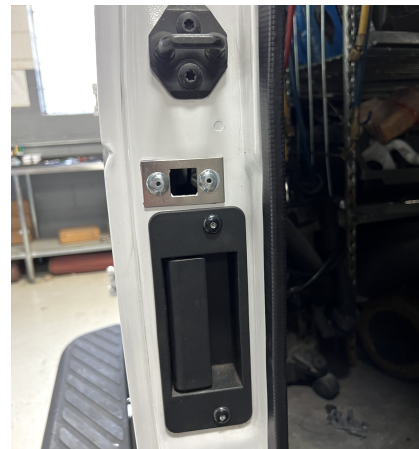
Rear Door "driver-side" Strike Plate Bracket Location