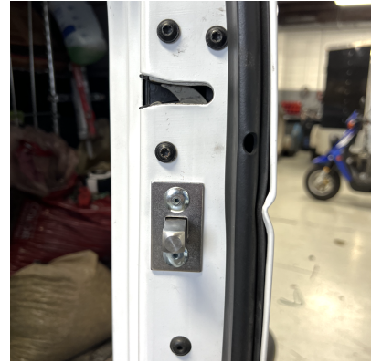
Rear Door "passenger-side" Housing Location