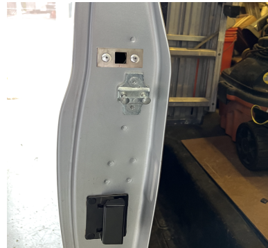
Side Swing Door "passenger-side" closest to back Strike Plate Location

Align this edge of the template with the edge of the door.