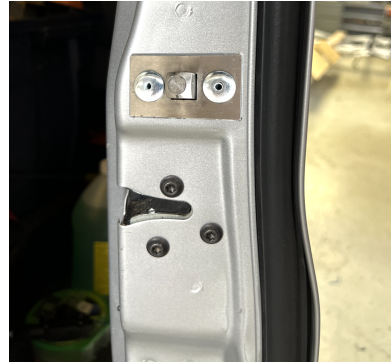
Side Swing Door "passenger-side" closest to front Housing Location