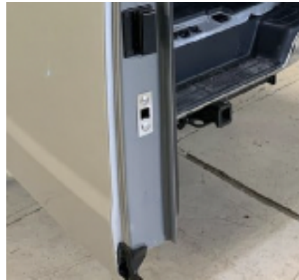
Rear Swing Door "driver-side" Strike Plate Location