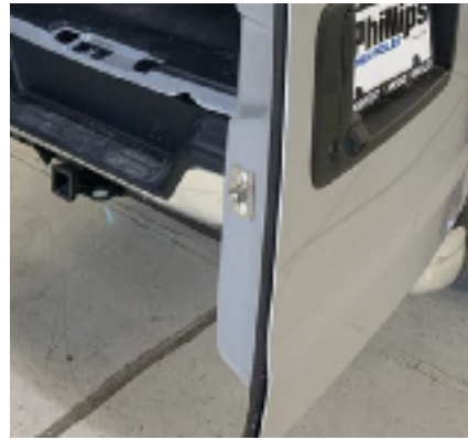
Rear Swing Door "passenger-side" Housing Location